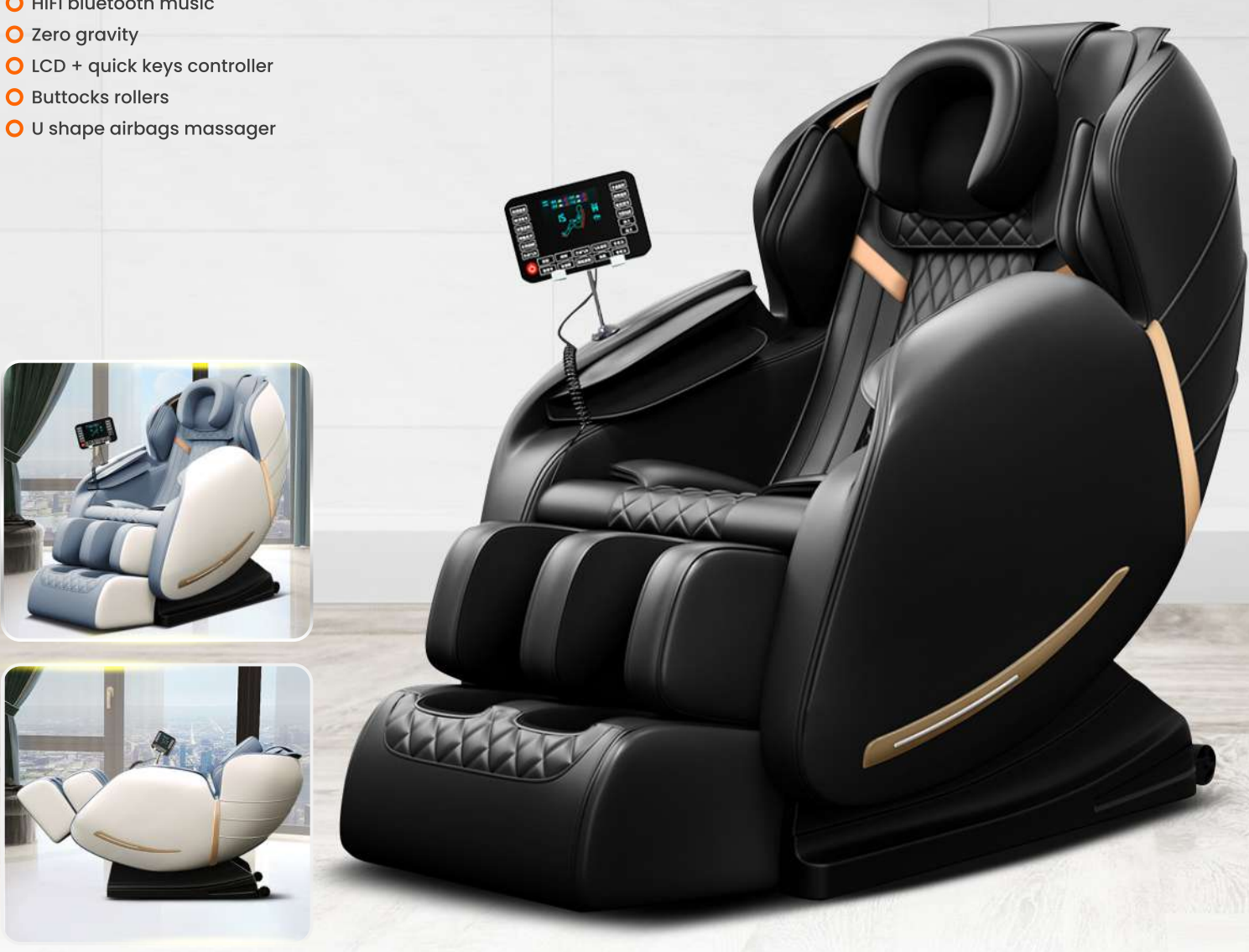
Better Sleep Quality