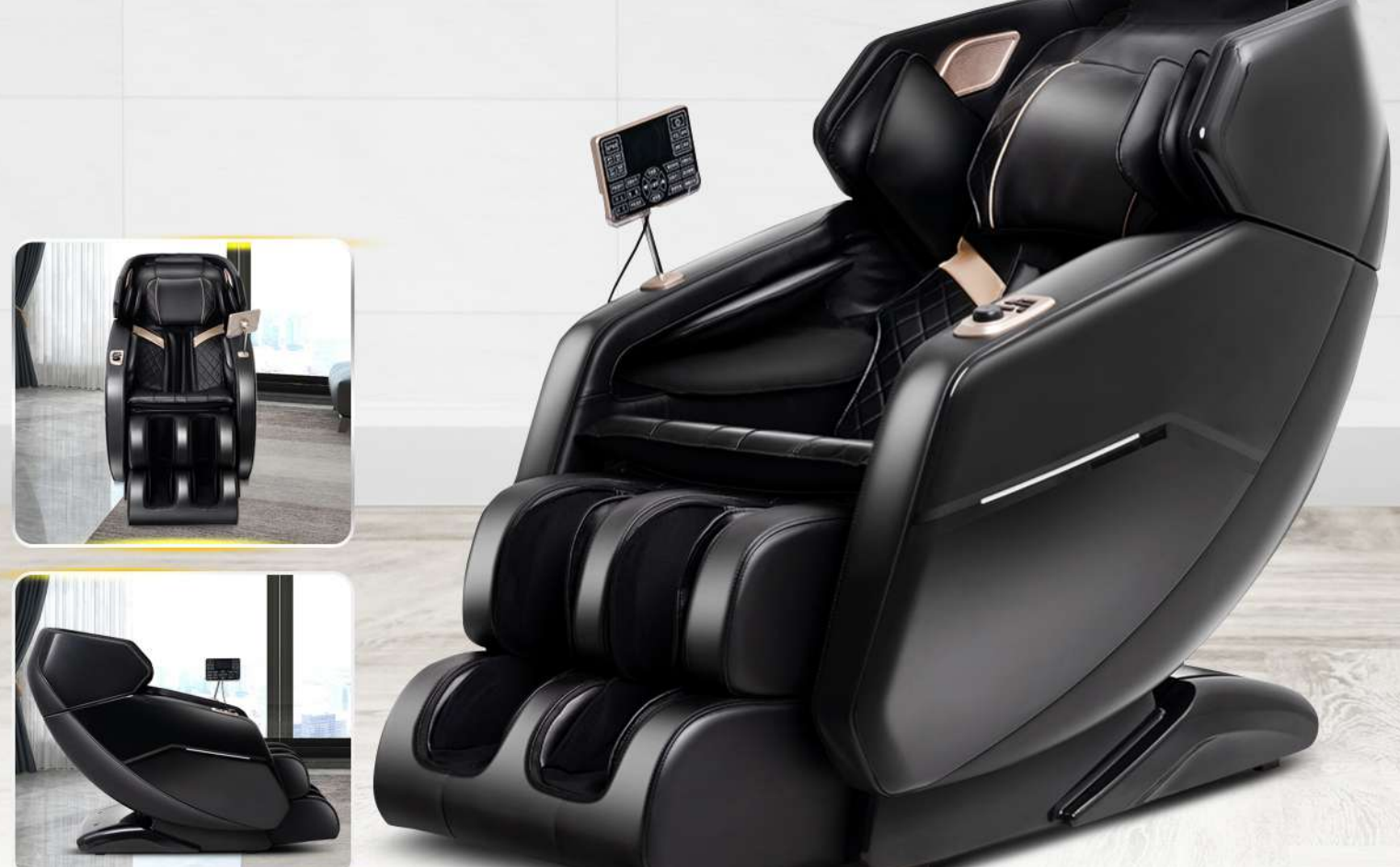
Better Sleep Quality