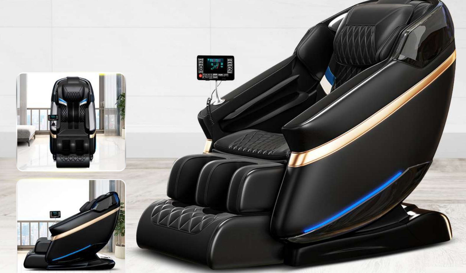
Better Sleep Quality