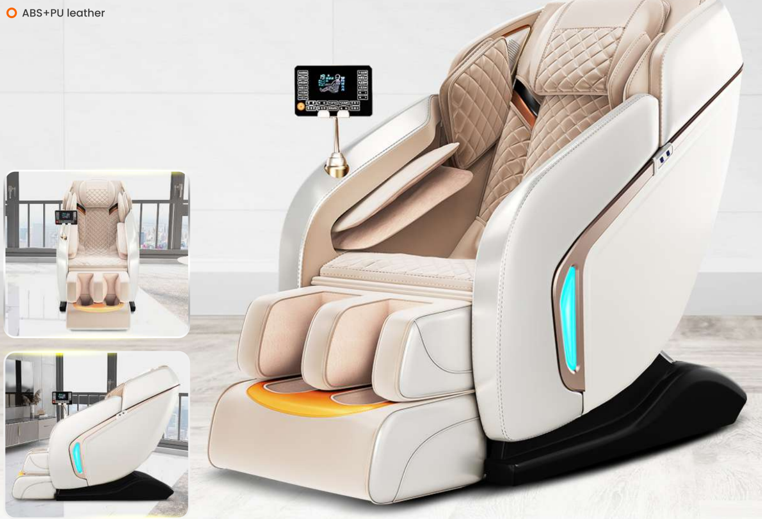
Better Sleep Quality