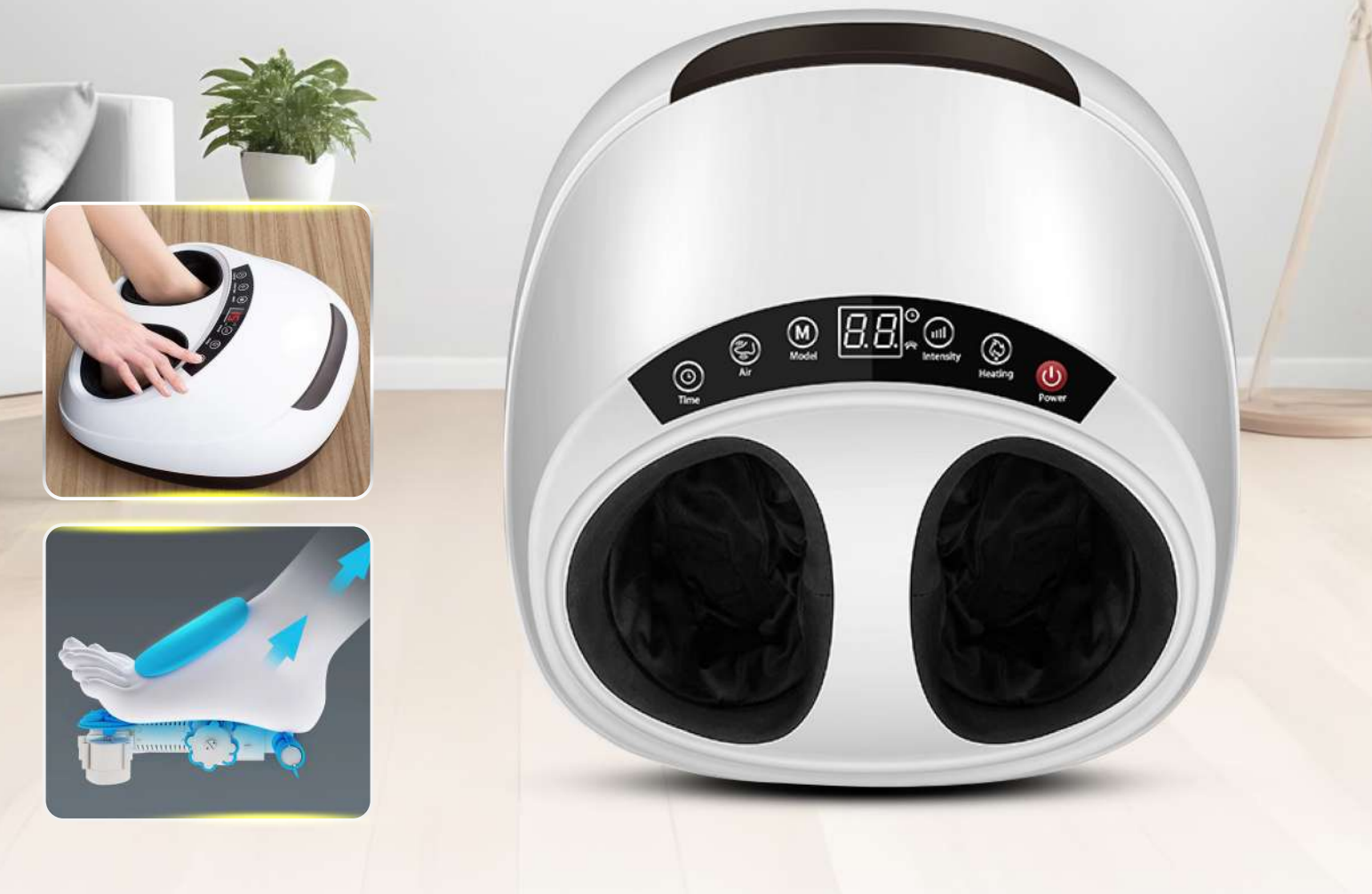
Better Sleep Quality