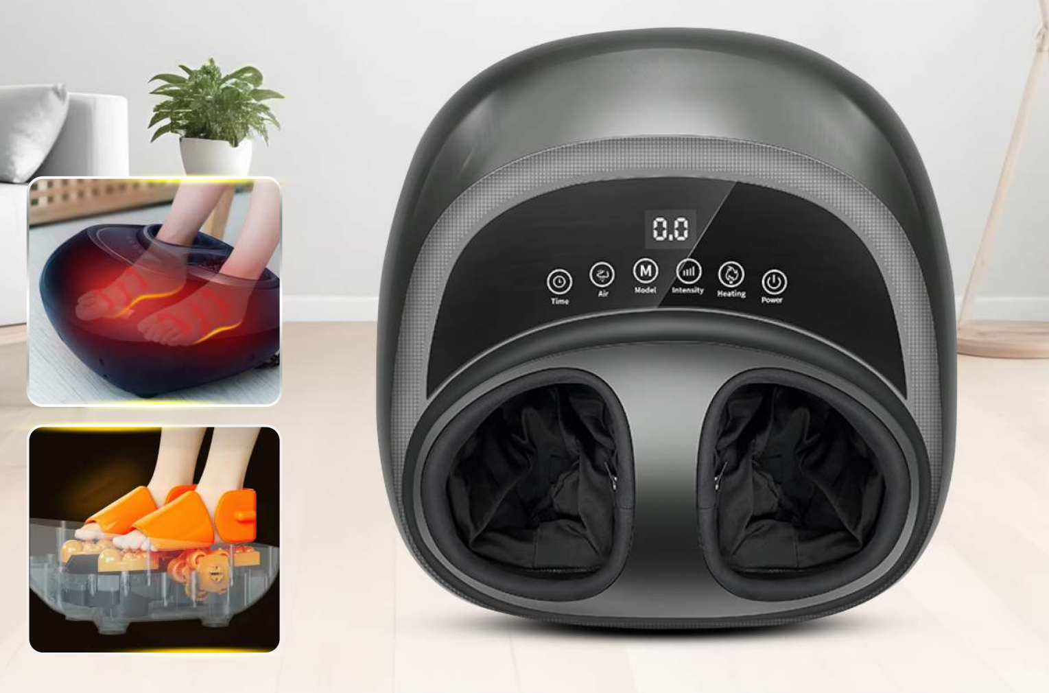
Better Sleep Quality