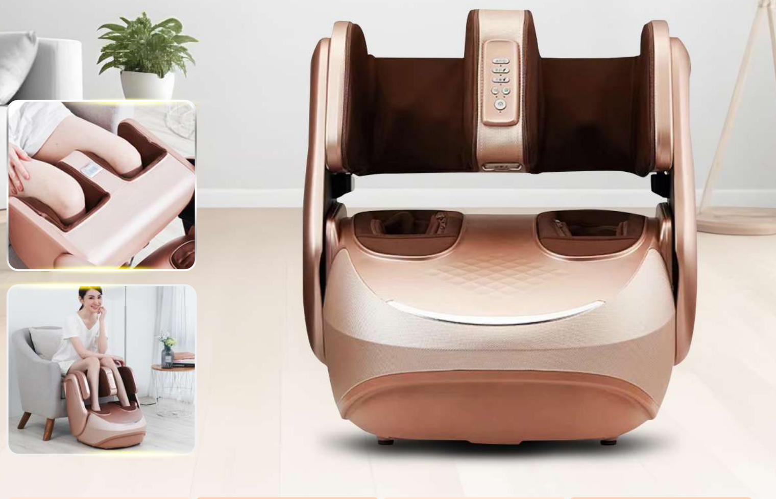
Better Sleep Quality