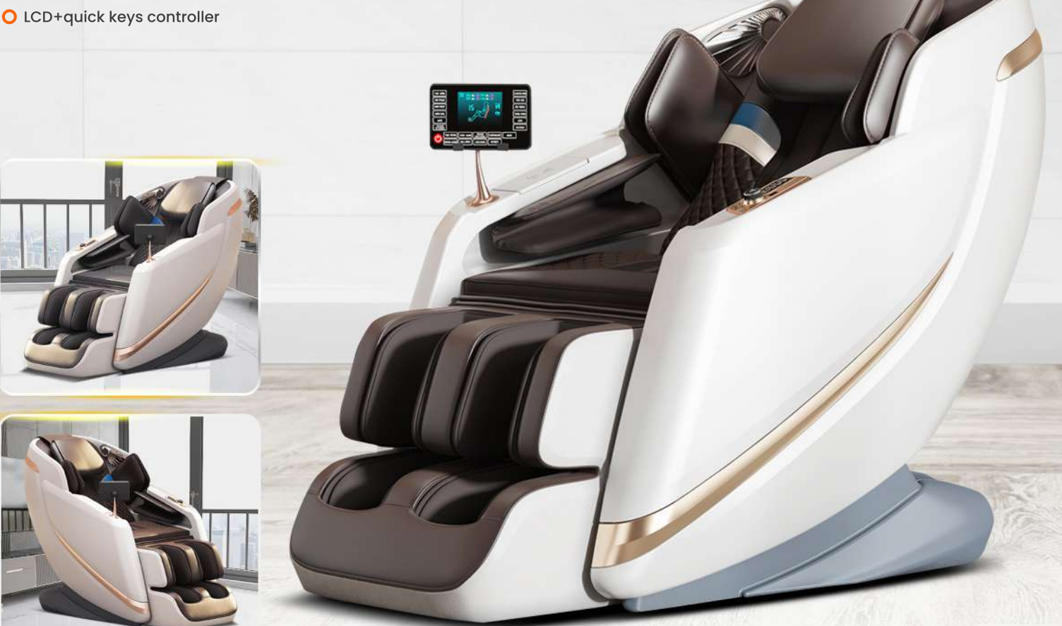
Better Sleep Quality