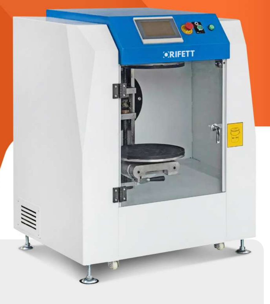
Consistency and Accuracy