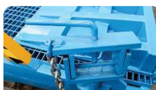
End Bracket Enable the Ramp to be Towable by Forklift