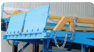
Can be 3-side loading or 2-side loading by adding lips on sides